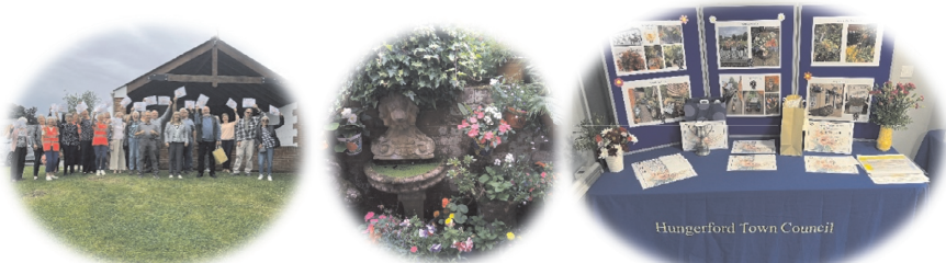
Hungerford in bloom award ceremony

Each year we consider awarding this Freedom to those, who in the opinion of our citizens, have made a significant contribution to the well-being of Hungerford.