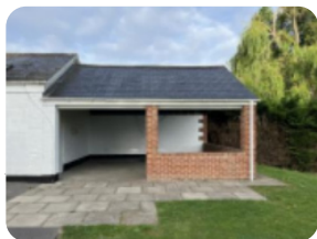
Proposed image of Hungerford's Community Shed